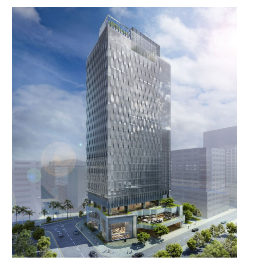
FTLife Tower 18 Sheung Yuet Road, Kowloon Bay

For the moment, a good alternative leasing location is Wong Chuk Hang in Island South as it is only two MTR stations away from Admiralty. This location has been emerging as a commercial district since 2011, from being a major industrial district and is slowly becoming a new office submarket, as landlords gradually convert industrial buildings into office use. The lack of amenities including F & B venues, retail and services like ATMs has been a concern but the upcoming 3.8M sq ft mixed use scheme on top of Wong Chuk Hang MTR station should definitely improve facilities.