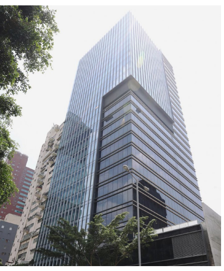
South Island Place Wong Chuk Hang

We expect the annual take up to increase to around 2 million sq ft on average from 2018 to 2022 which is an increase of 130% from the previous 5 years.