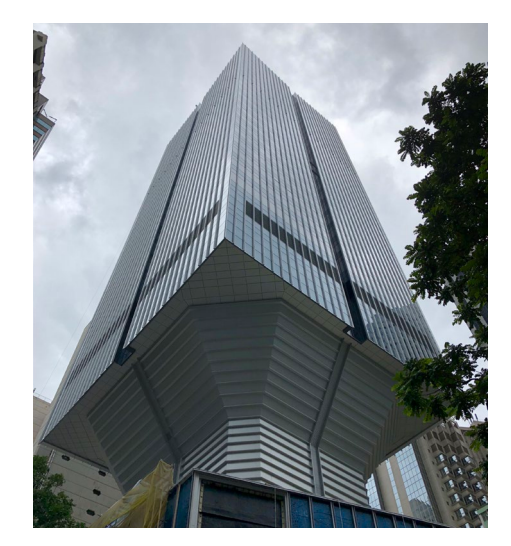
One Hennessy 1 Hennessy Road

We anticipate rental rates will have advanced by around 8% for the whole of 2018 and despite an increase in supply next year and in 2021 we foresee rates firming by a further 9% for the following 18 months.